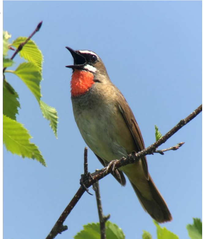
Siberian Rubvthroat. Hokkaido

After breakfast, we will set off to explore the eastern portion of the Akan-Mashu National Park. At the viewpoint overlooking the beautiful crater lake of Lake Mashu, we will admire not only the spectacular scenery of this volcanic region, but also watch for Pacific Swifts overhead, hoping for a White-throated Needletail amongst them, and keep an eye open for any raptors. White-tailed Eagle, Black (Black-eared) Kite, Eurasian Sparrowhawk, and Eurasian Goshawk, and are all possible here. A little to the north we will visit a delightful blue pond and try for Japanese Robin in the local forest, before dropping in at a local river to watch for returning salmon attempting to scale and overhanging waterfall. Continuing a little further west, we will visit briefly the bright yellow sulphuroles and bubbling steam vents at Iwo-zan to admire this extraordinary geological feature, before visiting the woodland along the shore of Lake Kussharo in search of any woodpeckers we may have missed, especially White-backed and Gray-headed. Common Mergansers are often at the lake where the Kushiro River flows out of the lake, and we may find Mandarin Duck and White-tailed Eagle in the area too.