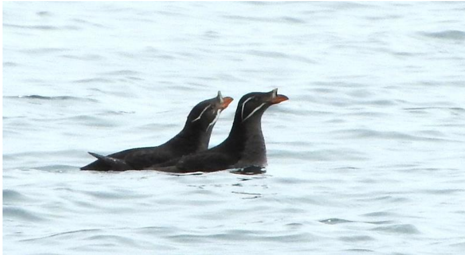
Rhinoceros Auklets, Hokkaido

In the afternoon, we will travel a short distance to the south to visit a grassland site where both Sakhalin Grasshopper Warbler and Lanceolated Warbler still occur. Both are elusive skulkers, the former with an explosive song and the latter with an extended reeling trill. More common and more easily seen here are Black-browed Reed Warbler, Long-tailed Rosefinch, and Olive-backed Pipit.