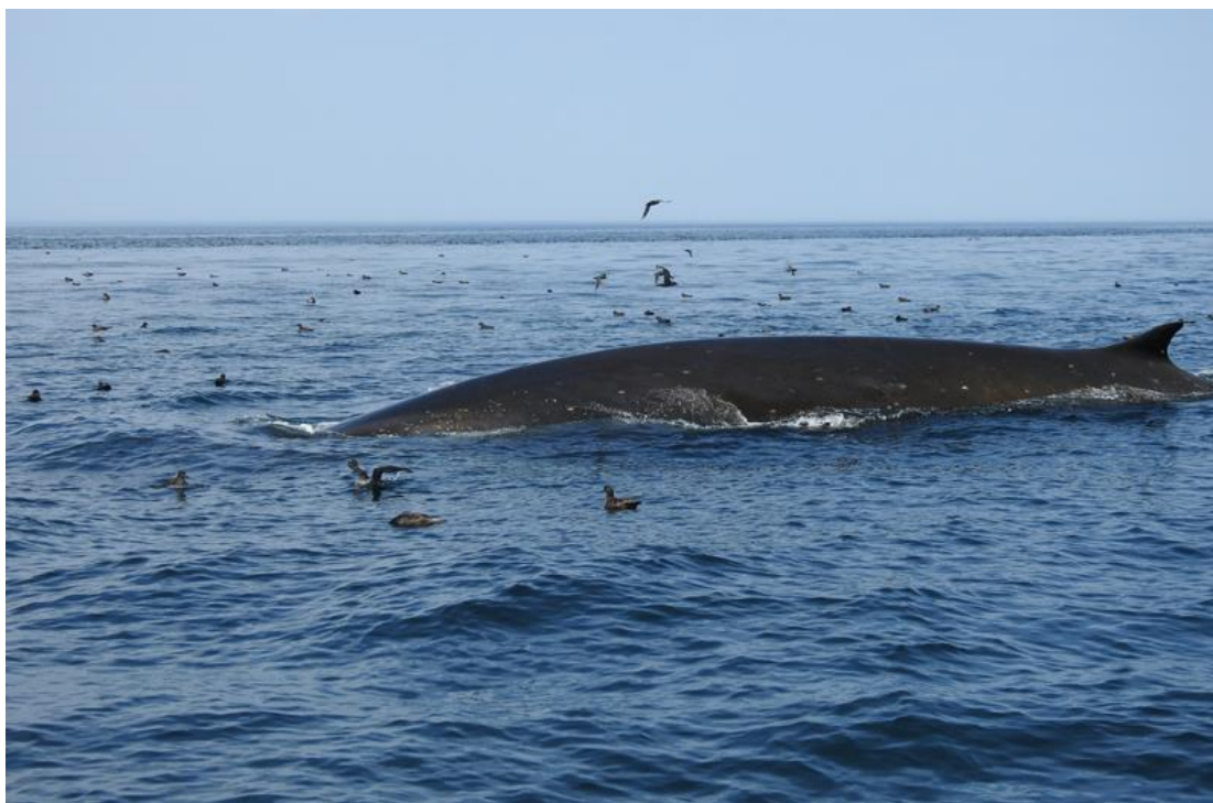
Fin Whale & Short-tailed Shearwaters, Hokkaido Mark Brazil

extraordinary. Among them we may find Northern Fulmar (now recognized as a separate species by some authorities as Pacific Fulmar, which here is invariably dark) and perhaps even a rare Flesh-footed Shearwater. Looking back to shore from the bay, the landscape is impressive, with isolated Mt Shari rising beyond Lake Toufutsu and the entire range of mountains, all volcanoes, that form the Shiretoko Peninsula to the east.