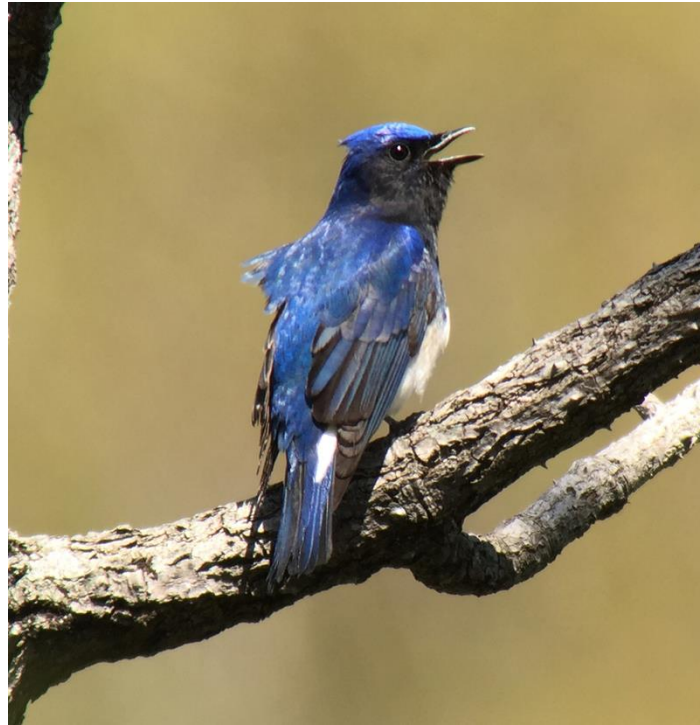
Blue-and-white Flycatcher. Hokkaido

Leaving Daisetsu behind, we will travel further east now, stopping at the Sounkyo Mt. Daisetsu Photo Museum and the waterfalls in Sounkyo Gorge on our way to Lake Oketo. There, we will spend the latter part of the afternoon close to the lake looking for our first White-tailed Eagles, and we will watch the Asian House-Martins that breed beneath the reservoir's Kanako Dam as we listen and watch for Oriental Cuckoo, Black Woodpecker, Blue-and-white Flycatcher, and Siberian Blue Robin.