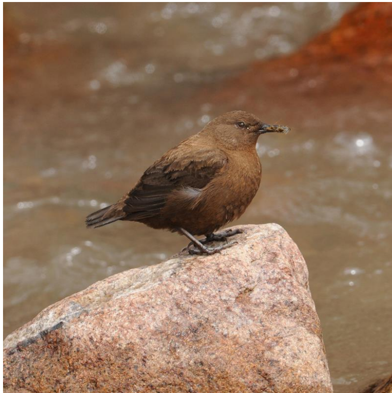
Brown Dipper

NIGHTS: Nukabira, Onsen Nakamura, Hokkaido