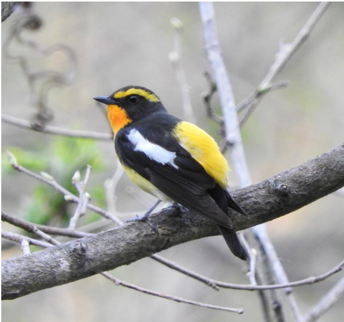
Narcissus Flycatcher, Hokkaido