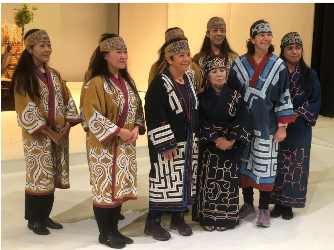
Ainu Dance Group, Hokkaido

Any journey in Japan exposes the visitor to daily doses of incidental Japanese culture which ranges from roadside Shinto shrines (devoted to the indigenous Japanese animistic religion) to ubiquitous hot and cold drinks vending machines, and taking in washoku (Japanese cuisine) and onsen (hot spring bathing). However, Japanese culture in Hokkaidō is as recent as western culture is in New Zealand — essentially dating back to widespread colonization during the 19th century. Prior to the arrival of the Japanese, the indigenous ethnic population of the island was entirely Ainu, a northern people descended from the ancient Jōmon people. Today, few Ainu remain, but their culture, and especially their deification of various iconic species of wildlife (Red-crowned Crane, Brown Bear, Blakiston's Fish Owl, Orca, salmon and so on) and their traditional ways of adapting to life in the natural environment of Hokkaidō, where winters are very severe, is fascinating. These twin cultural elements, both Ainu and Japanese, will run through our tour as we explore the Akan–Mashu,