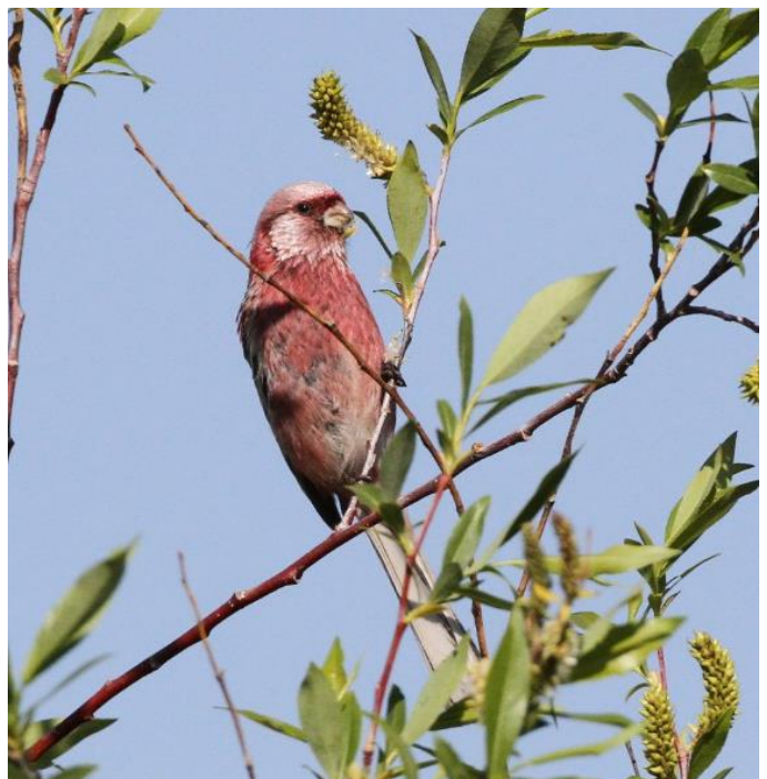
Long-tailed Rosefinch

May 30, Day 3: Akankohan Onsen. This morning, we will birdwatch beside the river and forest close to our accommodation, then later take a walk in the woods beside Lake Akan with a member of the local Ainu community, learning about their culture and relationship with nature. Birds we will seek include our first gorgeous Narcissus and Blue-and-white flycatchers, and a secretive songster famed in Japanese literature—Japanese Bush Warbler. The song of the latter will be an accompaniment on many of our walks in the days ahead.