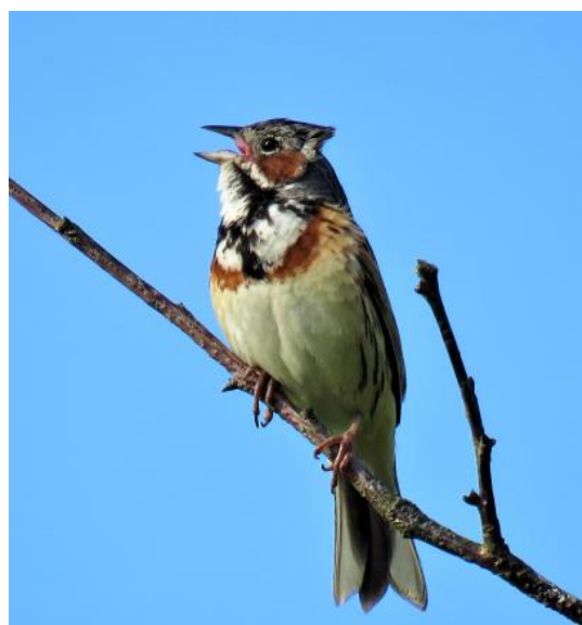
Chestnut-eared Bunting

While exploring offshore into Abashiri Bay by chartered boat this afternoon, there are opportunities for a number of cetaceans including Dall's Porpoise, Northern Minke Whale, and even Fin Whale. We will be watching not only for these but also for any seabirds that we can find. As we leave the harbor at Abashiri, we will see Japanese Cormorant, Black-tailed and Slaty-backed gulls, and, once offshore, we may encounter loons (Red-throated, Arctic, or Pacific). Rhinoceros Auklets are usually found close inshore; further offshore, large numbers of migratory Short-tailed Shearwaters gather. They have come from the Antipodes. At their peak they number more than 100,000 birds. If conditions are right, the sight, sound, and strangely musty smell of the birds are