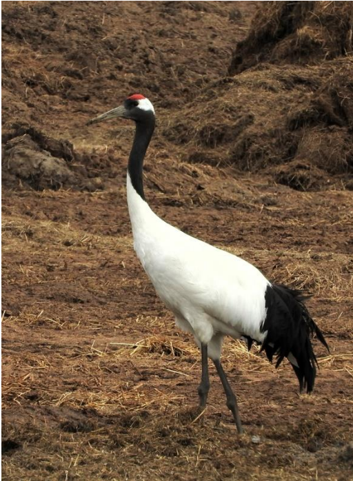
Red-crowned Crane, Summer

For those who have become onsen aficionados, this will be a wonderfully relaxing way to round out our “Birding in the Land of the Ainu” Journey.