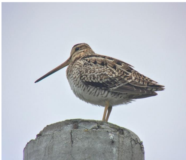
Latham's Snipe, Hokkaido

June 5, Day 9: Abashiri. After some local pre-breakfast birding near our accommodation, we will pay a visit to the Northern Peoples Museum. This excellent museum explains the presence of Ainu in Hokkaidō in the context of other Northern Hemisphere peoples and helps us understand the cultures of this region of the world.